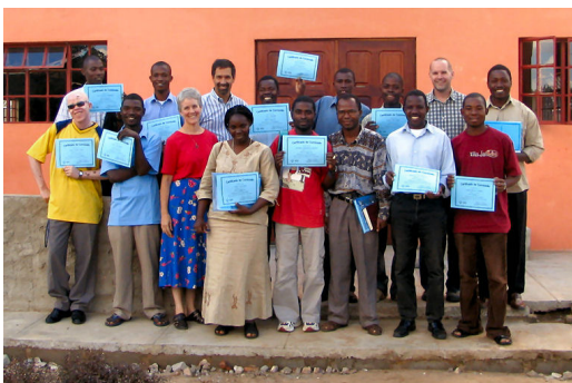
OMS group with certificates

It was gratifying to watch her joy and personal fulfillment as she shared the teachings with the group and coached them as they began to teach. When we